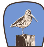
ST GEORGE ISLANI VACATIONS